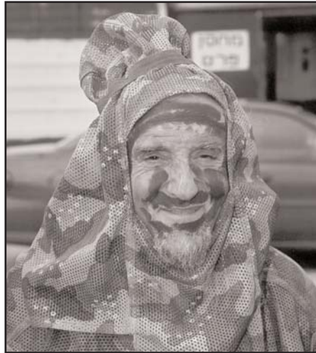
Rabbi Haskel Lookstein in disguise

It is hard to describe adequately the feeling of pride and enthusiasm